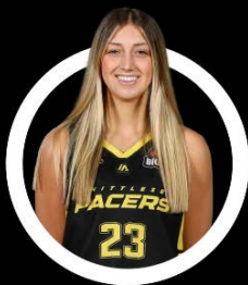
Peyton Burns Youth League 1 Women